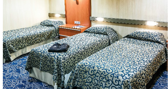
Figure 15: Cabin Category 1 Quad.

Deck four: interior cabin, four lower berths, private bath. Approximately 73 square metres (240 square feet).