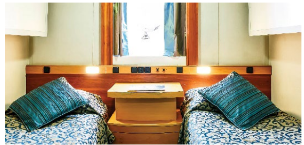
Figure 12: Cabin Category 4 Exterior Twin.

Deck four: porthole window, unobstructed view, two lower berths, private bath. Approximately 30 square metres (100 square feet) for twin beds or 27 square metres (90 square feet) for a single bed.