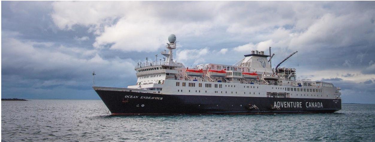
Figure 5: "Ocean Endeavour".