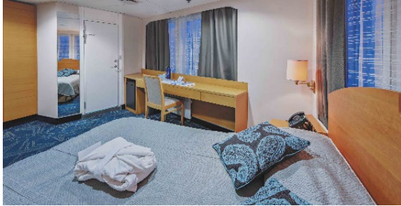
Figure 9: Cabin Category 7 Select Twin.