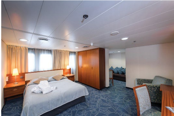
Figure 6: Cabin Category 10 Suite.

Deck seven: forward-facing picture windows, unobstructed view, matrimonial bed, private bath with full tub, refrigerator. Approximately 95 square metres (310 square feet).