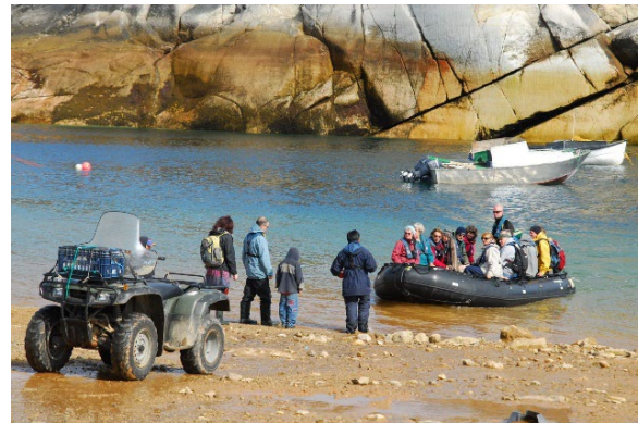
Figure 2: A Zodiac expedition.

Cruise among icebergs. Search for marine mammals. Visit an outpost community. Wander remote coastlines. Simply enjoy the freedom of being out on the water daily! Our goal is to get you off the ship, as often as possible.