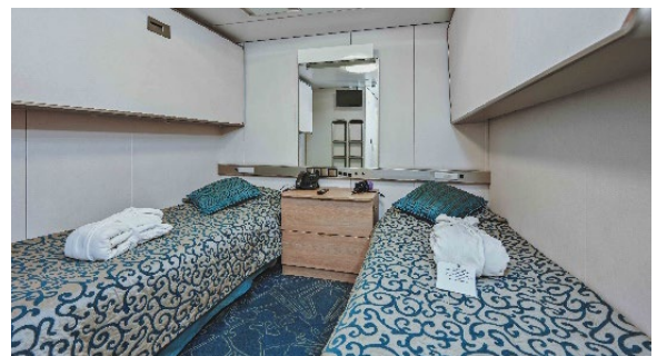
Figure 13: Cabin Category 3 Interior Twin.

Deck five: interior cabin, two lower berths, private bath. Approximately 38 square metres (125 square feet) for twin beds or 34 square metres (110 square feet) for a single bed.