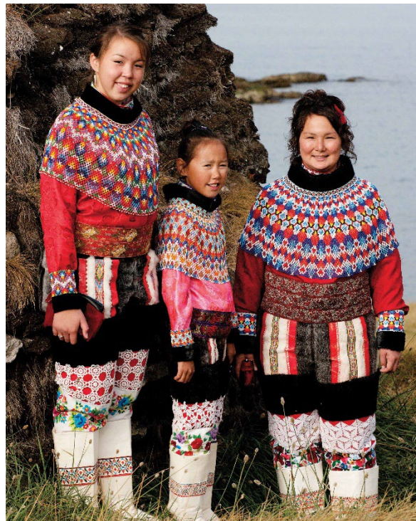
Figure 4: Girls in traditional Greenlandic clothing.

Save 30% on the cabin cost for travellers under thirty years of age. Can be combined with the Free Single Supplement and League of Adventurers Loyalty Rewards Program.