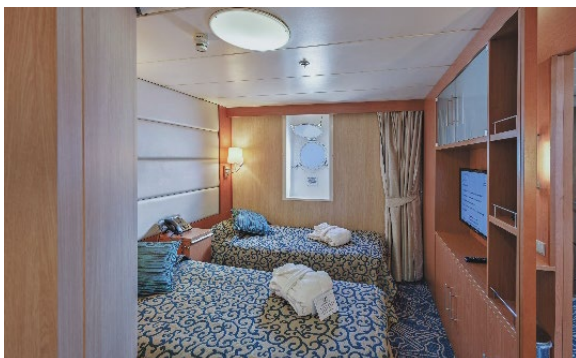
Figure 10: Cabin Category 6 Comfort Twin.

Deck eight: picture windows, obstructed view, matrimonial bed, private bath, refrigerator. Approximately 49 square metres (160 square feet).