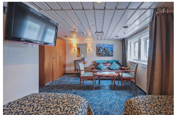
Figure 8: Cabin Category 8 Superior Twin.

Deck seven midship: picture windows, partial obstruction, matrimonial bed, private bath, refrigerator. Approximately 60 square metres (190 square feet).