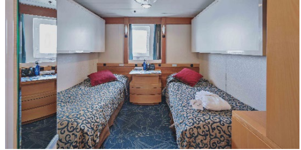
Figure 11: Cabin Category 5 Main Twin.

Deck five: picture window, unobstructed view, two lower berths, private bath. Approximately 35 square metres (115 square feet).