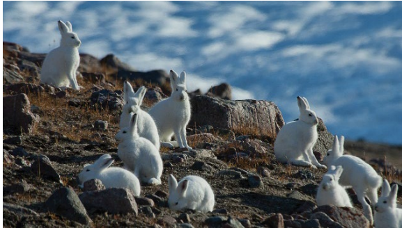
Figure 3: Arctic hares, Greenland.

League of Adventurers Loyalty Rewards Program, and Early Booking Bonus. Subject to cabin availability.