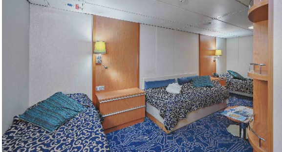
Figure 14: Cabin Category 2 Triple.

Deck four: interior cabin, three lower berths, two private baths. Approximately 61 square metres (200 square feet).