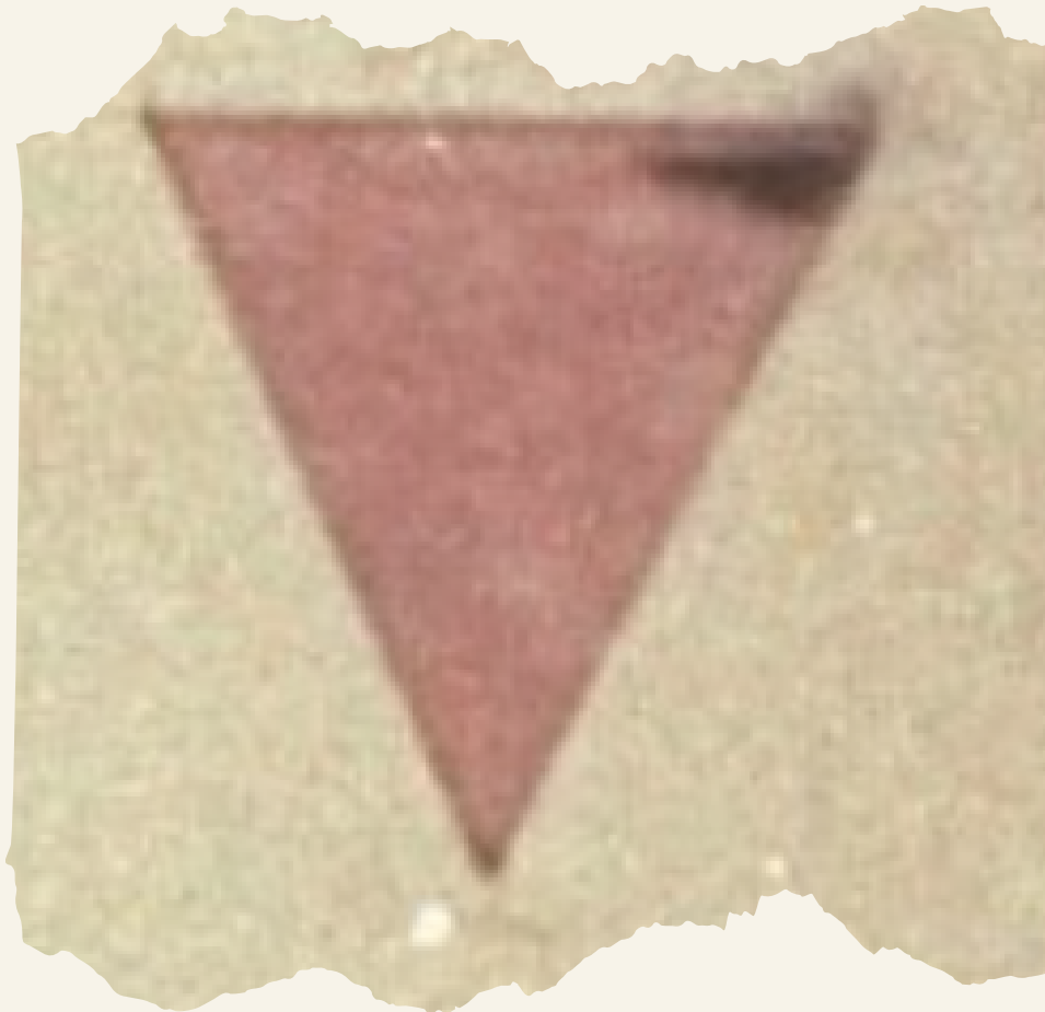
LGBTQ+ individuals were identified in concentration camps by a pink triangle sewn to their uniforms.

The stigma against LGBTQ+ individuals did not end with the war. Gay men were not recognized as victims of Nazism after the war and faced continued persecution under Paragraph 175, which was not completely abolished until 1994 and the reunification of East and West Germany. New research on queer experiences under Nazism, including transgender individuals and lesbians, is emerging more frequently over recent years.