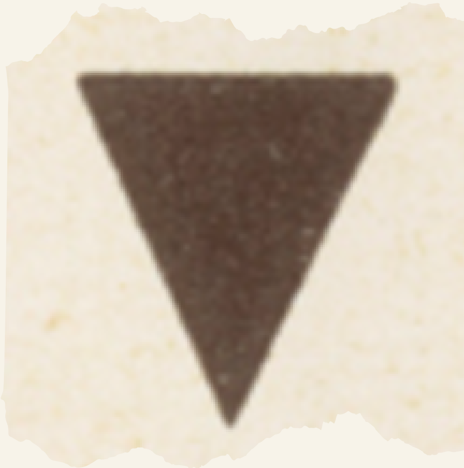
Roma and Sinti were identified in concentration camps by a black (or brown in some camps) triangle sewn to their uniforms.

By 1945, it is estimated between 200,000 and 500,000 Roma and Sinti had been murdered in the genocide known as “Porajmos” (translated to “the devouring” in some Romani dialects).