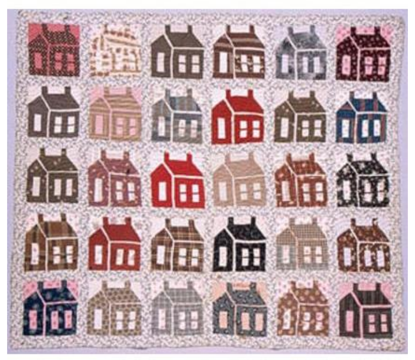
Pieced Quilt with House Pattern. c.1850-80